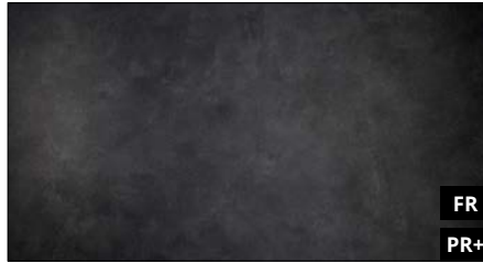
DM Classy Black AR 2600 x 1000 / NA 19325 / SA 19336