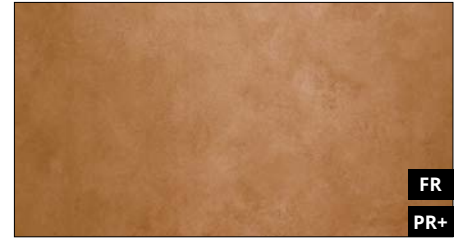
DM Classy Copper AR 2600 x 1000 / NA 19199 / SA 19207