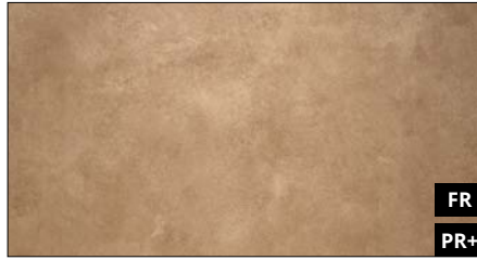
DM Classy Bronze AR 2600 x 1000 / NA 19011 / SA 19022