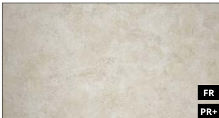
DM Iron Age AR 2600 x 1000 / NA 19201 / SA 19209