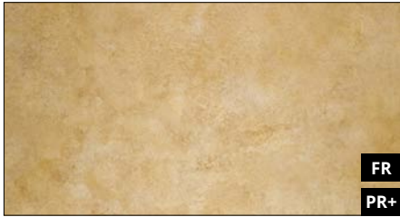
DM Classy Gold AR 2600 x 1000 / NA 19010 / SA 19021