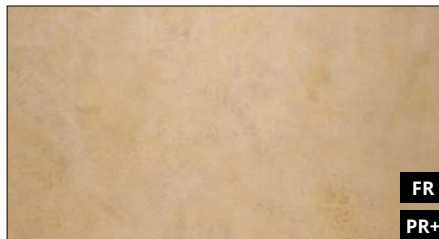
DM Silent Gold AR 2600 x 1000 / NA 19200 / SA 19208

From the outset the idea was, "Not to create everything for everyone, but instead something special for a few." This credo has resulted in our FURNITURE | COLLECTION, a new SIBU range that opens the door to fashionable furniture fronts.